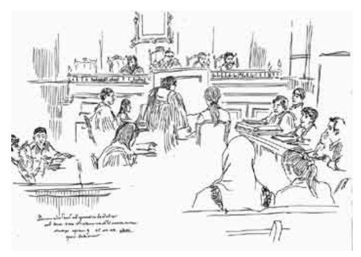
Drawing by Chumpol Akkapanpanonta