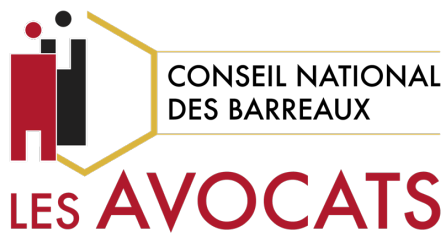
Conseil National des Barreaux (CNB) - French National Bar