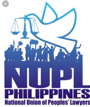
Philippines National Union of Peoples' Lawyers (NUPL)