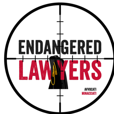
Endangered Lawyers (Italy)