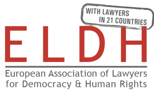
European Association of Lawyers for Democracy and World Human Rights (ELDHR)