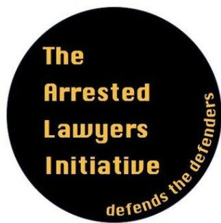
Arrested Lawyers Initiative (Turkey)