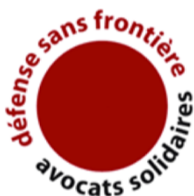
Défense sans Frontière - Avocats Solidaires (DSF AS)